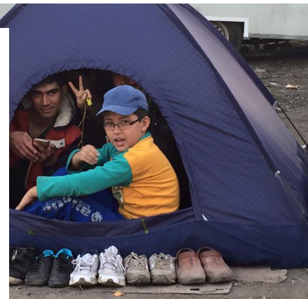
TRAPPED IN TRANSIT: THE EVOLVING SYRIAN REFUGEE POLICY CRISIS IN GREECE